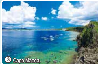
3 Cape Maeda

You can get a great view of the East China Sea from Cape Maeda. The sea right in front of you is crystal clear, which makes the spot very popular among divers. You can also enjoy surf fishing here, too. At the popular diving spot, there are steps leading down into the water.