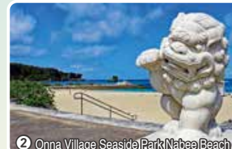
2 Onna Village Seaside Park Nabee Beach

This facility has souvenir shops, restaurants, an exhibition space and an observatory. It is a three-story building with a local specialty corner on the first floor, restaurants and shops on the second floor, and an observatory overlooking the sea on the third floor.