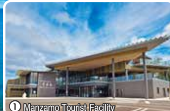
1 Manzamo Tourist Facility

The park features a flat meadow that extends to the edge of a 20 m-high Ryukyu limestone cliff. The name is said to originate from the words of the former king of Ryukyu, Shoikei, who praised the place as being "a Mo (field) that is big enough for 10,000 people (Man) to sit (za)." The sunset is also beautiful and shouldn't be missed.