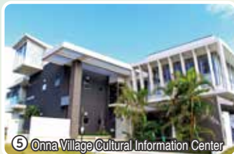
5 Onna Village Cultural Information Center

A farmers' market where you can buy Okinawan vegetables, tropical fruits, and various souvenirs. There are 10 shops where you can enjoy popular Okinawan B-class gourmet dishes. Onna Station is located at the entrance to the Onna Village Sunset Kaido viewed from the south side. You can "nakayukui" (take a break) at this market.