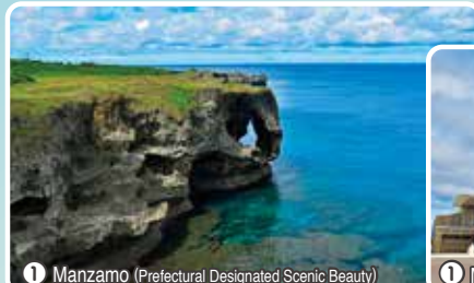
1 Manzamo (Prefectural Designated Scenic Beauty)

The park features a flat meadow that extends to the edge of a 20 m-high Ryukyu limestone cliff. The name is said to originate from the words of the former king of Ryukyu, Shoikei, who praised the place as being "a Mo (field) that is big enough for 10,000 people (Man) to sit (za)." The sunset is also beautiful and shouldn't be missed.