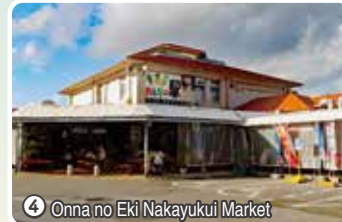
4 Onna no Eki Nakayukui Market

You can get a great view of the East China Sea from Cape Maeda. The sea right in front of you is crystal clear, which makes the spot very popular among divers. You can also enjoy surf fishing here, too. At the popular diving spot, there are steps leading down into the water.